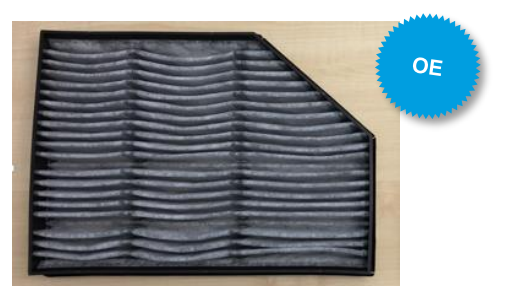
OE versions: CU 32 011, CU 32 012, CUK 32 011