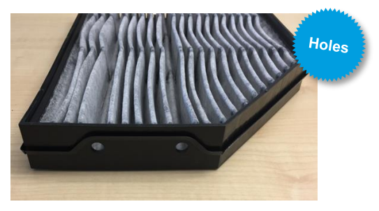
Image2 : The OE filter has two holes. Two pins placed in the housing can ingress in the filter.

Image 1 : The IAM solution has a sword, so no pins do ingress. Besides that, a significant better folding picture is produced by gluing the element in the plastic frame.