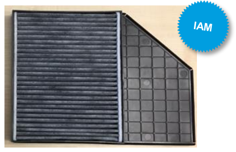
IAM versions: CU 32 011/1, CU 32 012/1, CUK 32 011/1